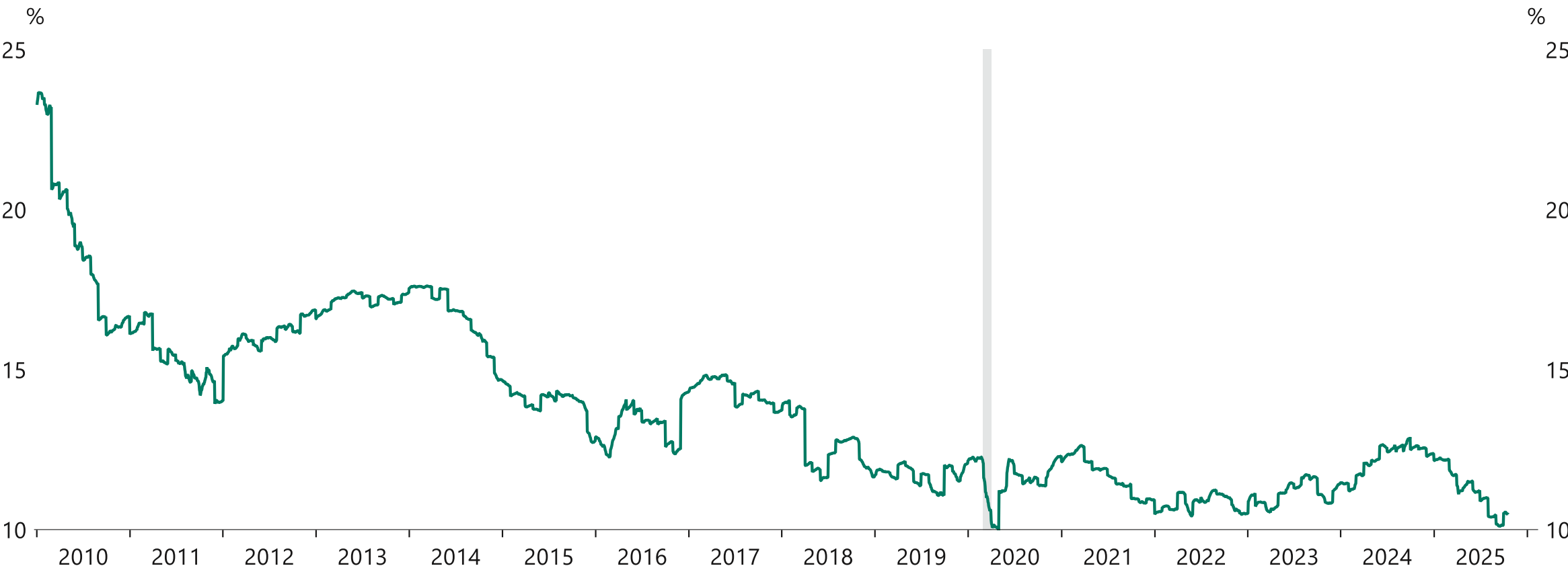
CCC share in US HY Index by market cap